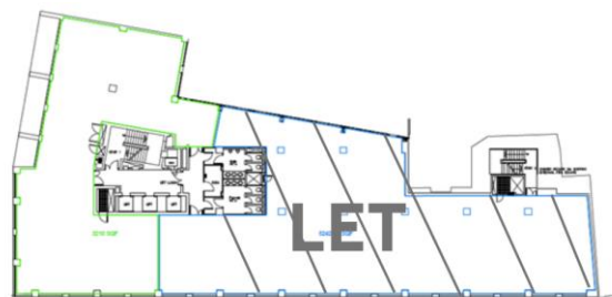
Floor Plan - 5 th Floor